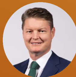
Ben Carroll Deputy Premier of Victoria & Minister for Education