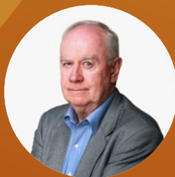
Paul Kelly Editor-at-large The Australian