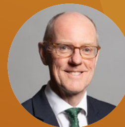
Nick Gibb Former Minister of State